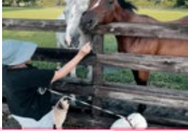
"Keep it Rural" from the 2025-26 town photo contest