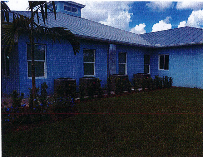
Photo One Caption 08/08/17 DETACHED GARAGE