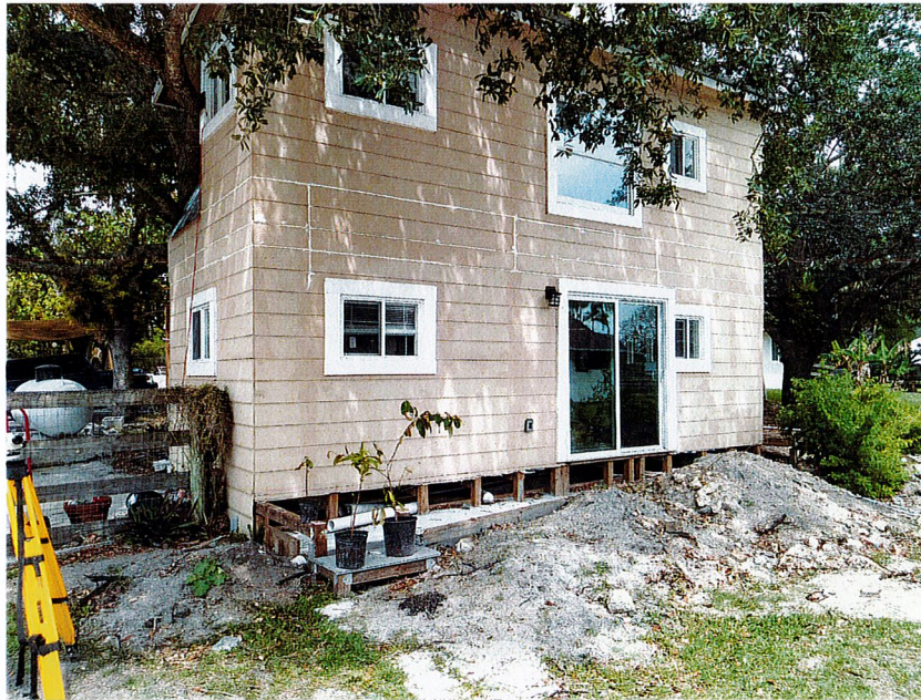
Photo One Caption FRONT VIEW

If using the Elevation Certificate to obtain NFIP flood insurance, affix at least 2 building photographs below according to the instructions for Item A6. Identify all photographs with date taken; "Front View" and "Rear View"; and, if required, "Right Side View" and "Left Side View." When applicable, photographs must show the foundation with representative examples of the flood openings or vents, as indicated in Section A8. If submitting more photographs than will fit on this page, use the Continuation Page.