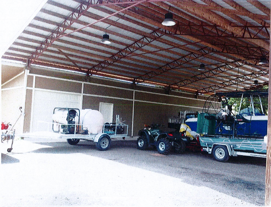
REAR VIEW 02/24/16